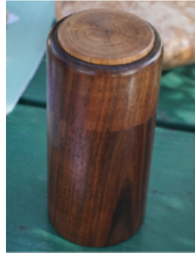
A box from Henry Koch , walnut & oak, Wood Turner's Finish.