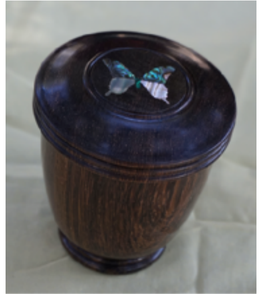
Bill Loitz had an inlaid box of Burmese blackwood, abalone shell, malachite, Carnuba wax finish.