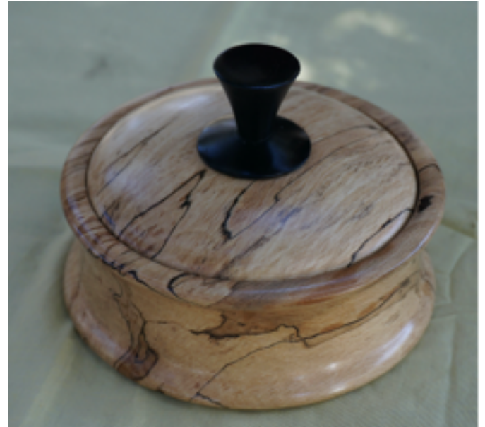
Jim Schopper's box of ebony & spalted maple, lacquer finish.