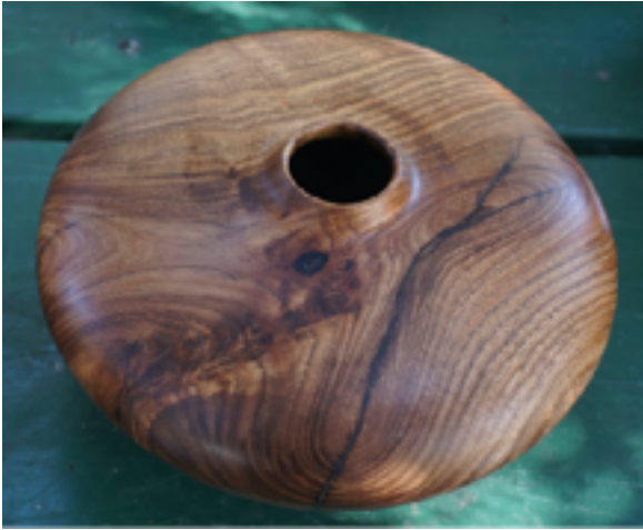
Another hollow form, this one from Black Acacia, oil & lacquer.