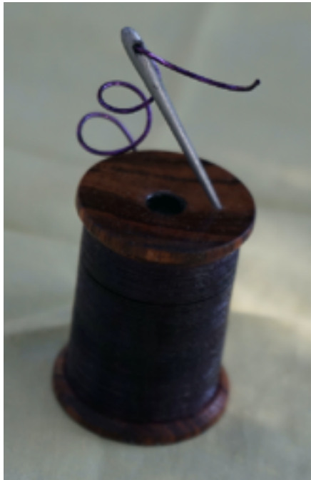
Carey Caires made a thread spool box, colored with felt pen, lacquer finish.