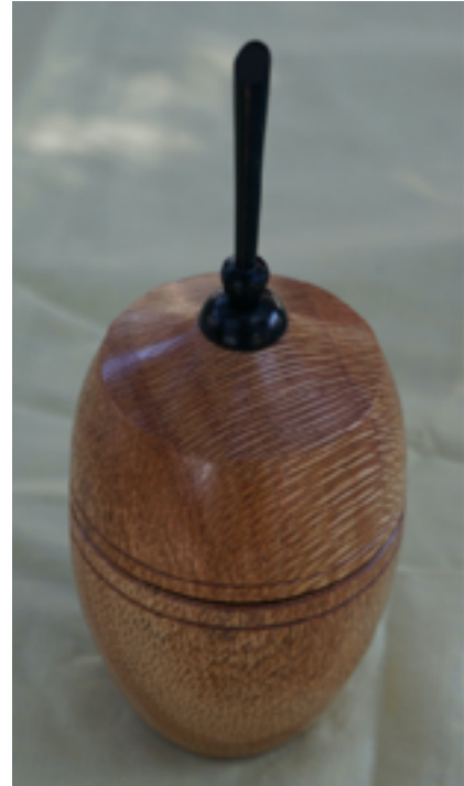
His second piece from silky oak & maple, Danish oil finish.