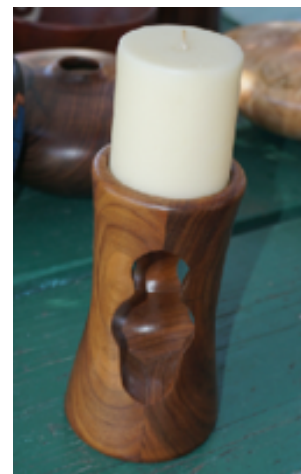
Inside out candle holder by Charles Hulien .