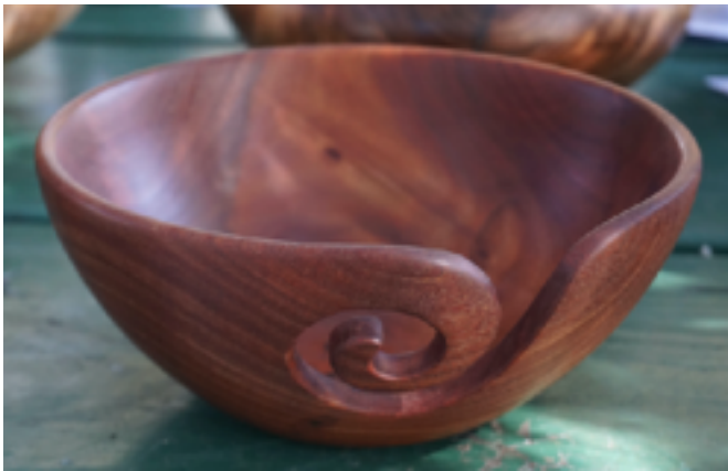
Yarn bowl of plum, lacquer finish.