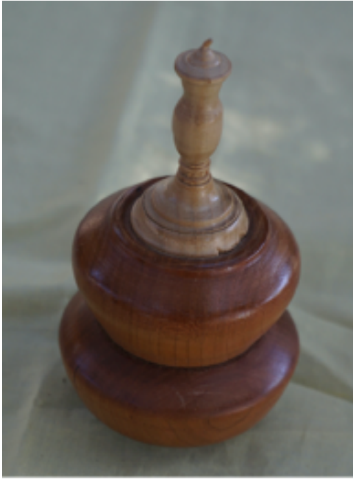
Blum had a cherry and maple entry, no finish specified.