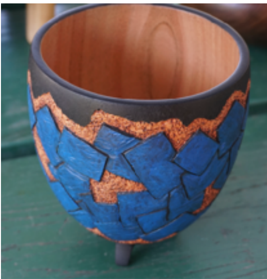
"Squares", Eucalyptus, black dye & acrylic.