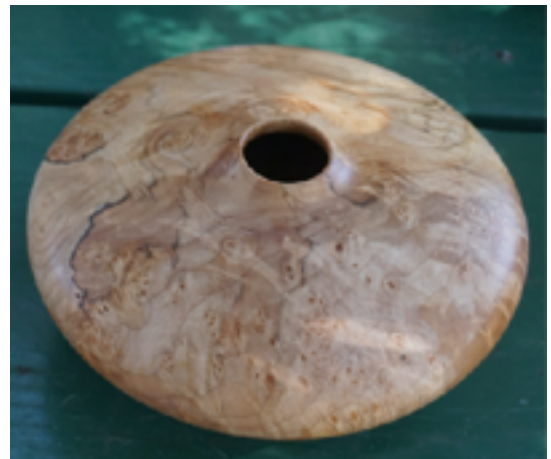
Hollow form of Buckeye burl, oil & lacquer