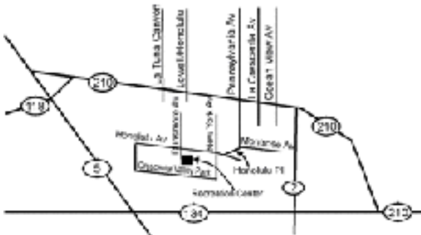
Thomas Guide 534-E-1

Crescenta Valley Regional Park Recreation Center Dunsmore & Honolulu, La Crescenta