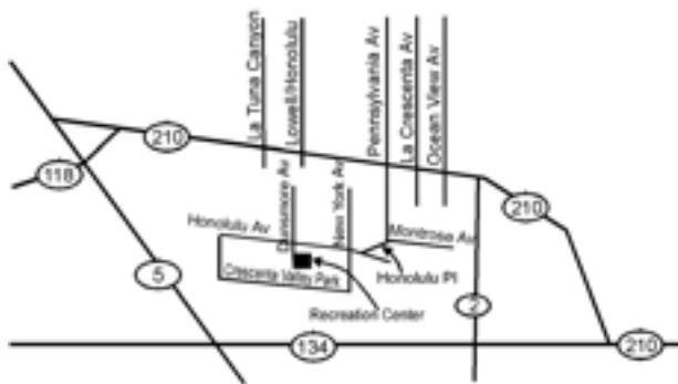
Thomas Guide 534-E-1

Crescenta Valley Regional Park Recreation Center Dunsmore & Honolulu, La Crescenta