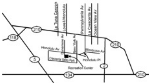
Thomas Guide 534-E-1

Crescenta Valley Regional Park Recreation Center Dunsmore & Honolulu, La Crescenta