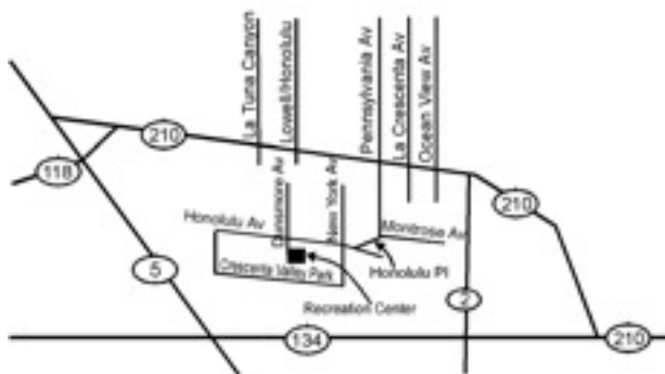
Thomas Guide 534-E-1

Crescenta Valley Regional Park Recreation Center Dunsmore & Honolulu, La Crescenta