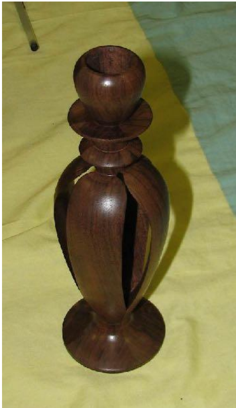
In the Advanced category Carey Caires brought in a "large" candlestick turned out of Ebony topped with a "birthday candle". It was finished with Walnut oil.