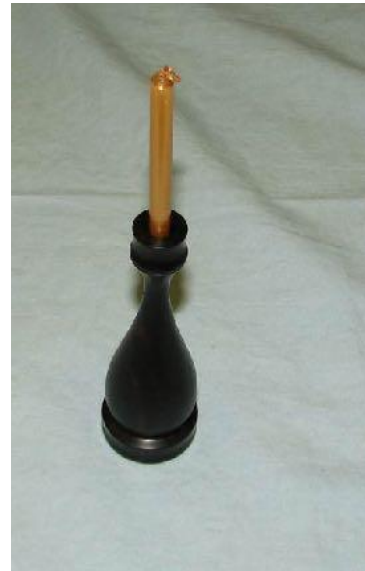
Next was Sandy Huse and what she titled "Baby's First Nightlight: Fishy, Fishy." It was made from a gourd with turned wood legs, glass, wire, fiber optic cable and a battery pack.