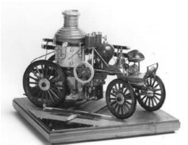
GWG 1902 American-LaFrance Steam Fire Engine