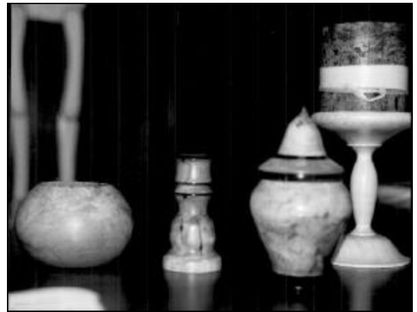
Show and Tell Beauties