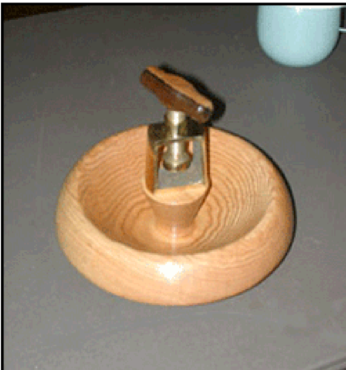
Ralph Otte's Nutcracker Bowl

Earleen Ahrens collected our turnings to display at our "Trees to Treasures" show at the Brand Library show. I probably have the numbers wrong but I have the impression that at least 63 members contributed over 130 turnings and a few lost souls are still contacting Earleen to bring in even more. Remember, our show will be in conjunction with the AAW "Put A Lid On It" show and will be open to the public on Saturday, June 14. We will also have a reception for the show on Thursday, June 26 at 6:00 to 9:00 PM, the day before the AAW Symposium