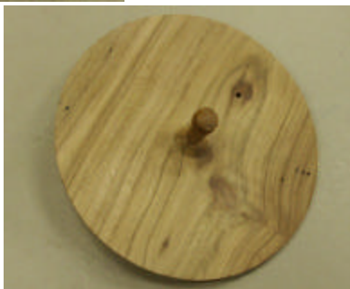
Art's winner for The Biggest Top