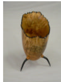
Alberto's Natural edge