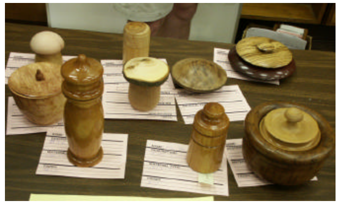
Novice Lidded Containers