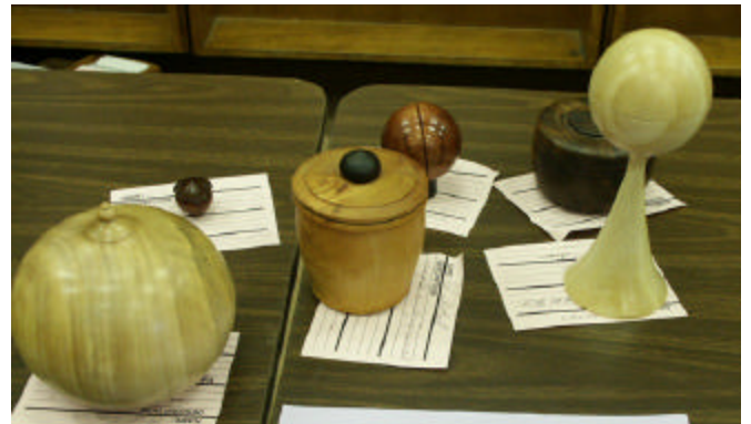
Advanced Challenge containers