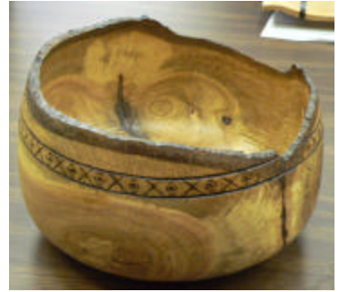
Ralph's Lake Arrowhead bowl

Ralph Chamlee made a beautiful bowl of black oak from Lake Arrowhead. It has great grain and he did a perfect southwestern decoration around the edge.