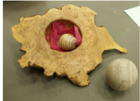
Intermediate: Earleen Ahrens