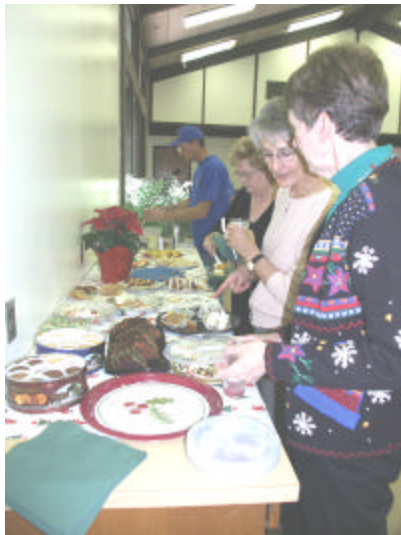
The dessert line