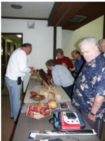
Items up for auction