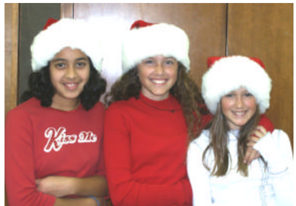
The 3 little elves