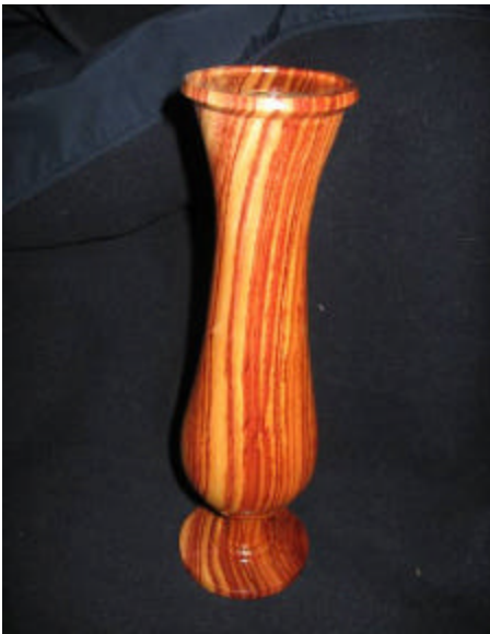
Floyd Petersen brought in a segmented bowl and a segmented hollow vessel. Both with a waterlox finish. Beautiful work.