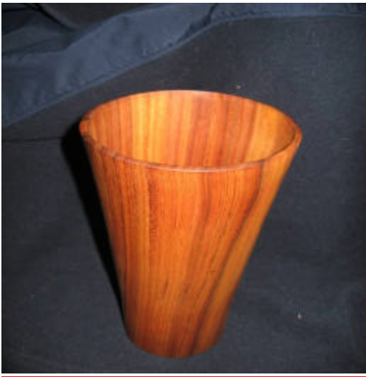
Jim Givens made a hollow vessel using Tulip wood.