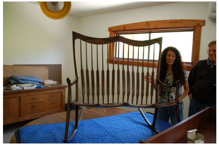
A double rocker made from ziricote in the finishing room.