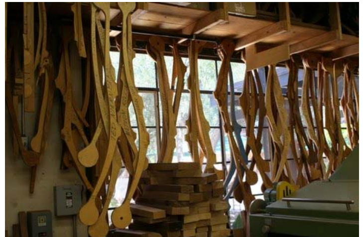
Patterns hanging up in Sam's shop window.