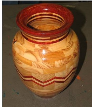
Al Falck brought in another segmented vase turned from alder, white oak, bubinga, and Carolina oak. Another beauty Al.