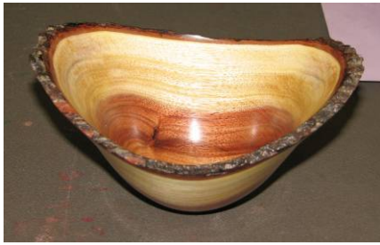
Jack Wooddell brought in a natural edge black acacia bowl.