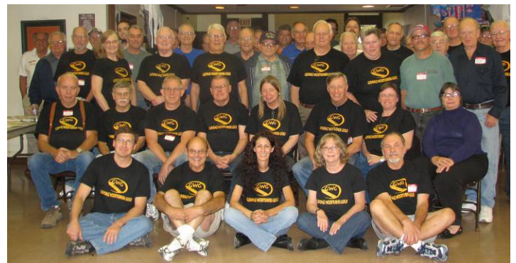
Here we are in our guild t-shirts.

Remember that you can bring anything from edible goodies to old tools for the auction.