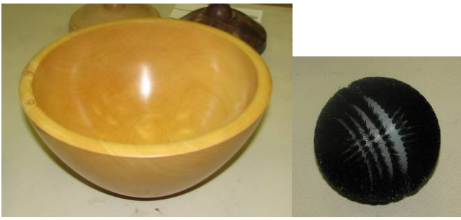
Owen Robbins brought in a Zebrawood bowl that was about 5 inches across.