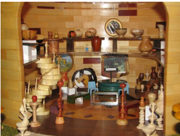
Here are two pieces from the instant gallery.

Here is a look inside of the winning chapter collaborative piece from the Dallas Area Woodturners entitled "Woodturners Museum of Art." They won the artistic category and won Best of Show.