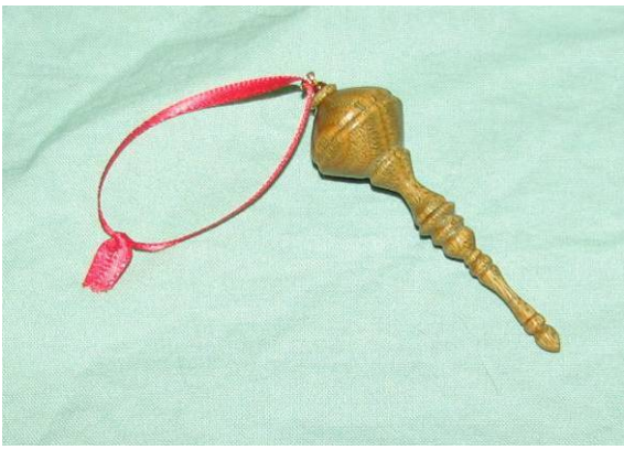
In the Intermediate category we led off with Nick Tuzzolino who had a good looking Buckeye burl ornament finished with lacquer.