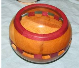
Terrell Hasker brought in two Ash bowls and one turned out of Maple and the other out of Pear. All had a walnut oil and beeswax finish.