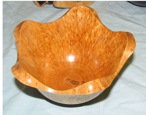
He also had a second taller bowl also of Masur Birch. And a third bowl that was nine sided and turned and carved from Alabaster.