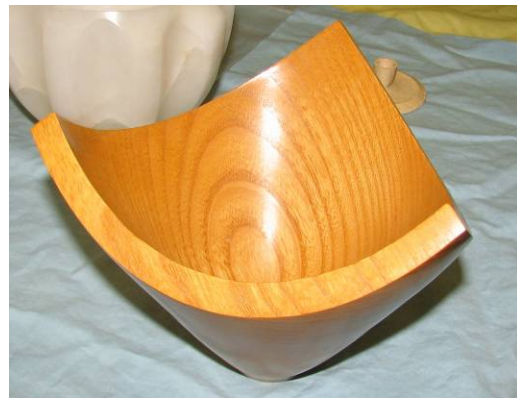
Carey Caires brought in three mini bowls. They were turned from Black & White Ebony and a laminated colored wood.