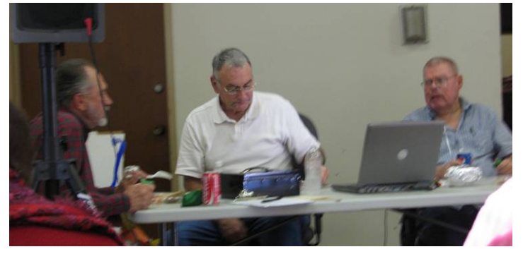
Here are the folks who made this another successful auction.