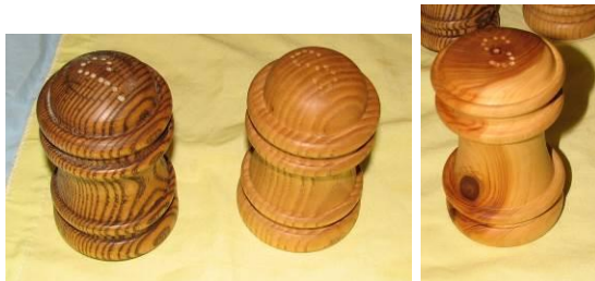
Dale Gertsch brought an ice cream scoop turned out of Walnut and had the winner in the category with his peppermill turned out of mystery wood. Both had a walnut oil finish.